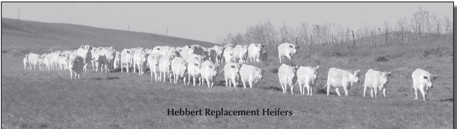
Hebbert Replacement Heifers